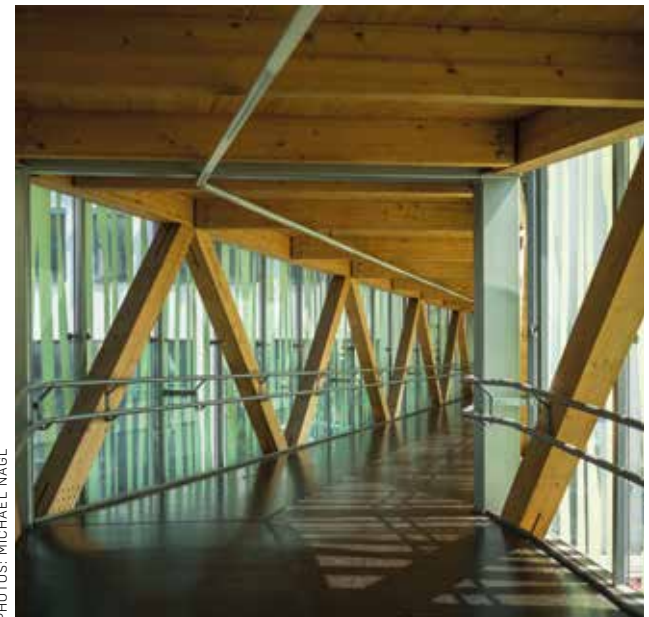
BOKU Vienna modernised the fire alarm systems to new IP technology during operation.

The entire modernisation of the facilities on the 40,000-square metre site took nine months from start to handover - partly because the technicians had to accommodate university circumstances when working. After all, it is equally as impossible to carry out an alarm test during an exam as to switch off the ventilation in a laboratory where sensitive research projects are currently under way. Despite all delays, the quality of the installed systems is impressive, and Schrack Seconet is already in discussions about follow-up projects. BOKU's operator, BIG, is currently considering upgrading the acoustic fire alarm to include visual signals. This would make orientation easier, especially on the floors that are connected between buildings by bridges. *